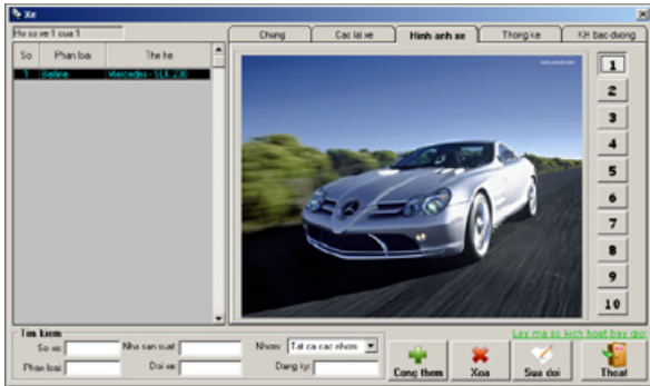
Image of car

When you install the software for your computer, your computer must be connected to Internet or MS.net Framework 1.1 has been installed.